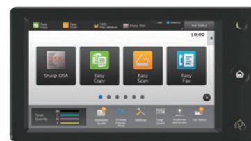
Award-winning 10.1" (diagonally measured) customizable touchscreen display.