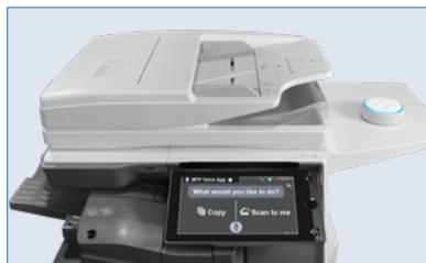
MX-6071S shown with available Sharp MFP Voice feature with Alexa.